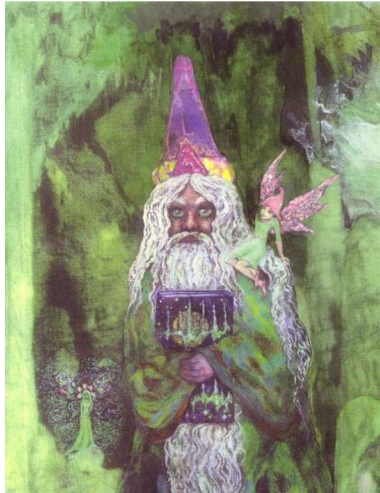
Cavern master Kooshakolho Ming Don, also called Heavens Eye or heart of the Rose, lord/monitor and guide to all crystalline rose clans